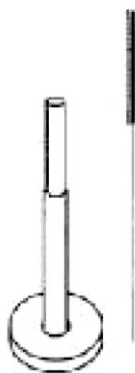
Figure 2: The Park Sham Device 5

Acupuncture studies using non-penetrating sham acupuncture as control were identified by a systematic search covering the period from 1998 onwards in